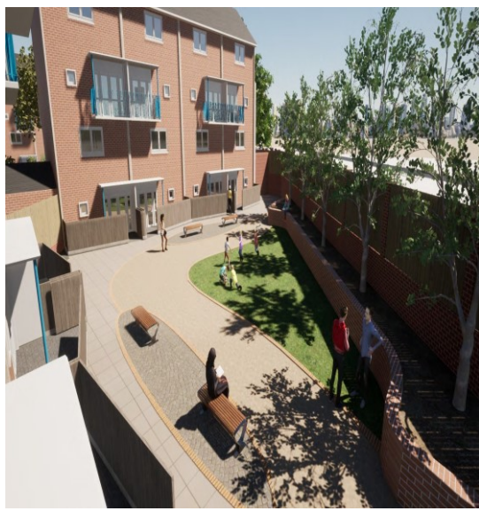
Before After An example of how the courtyard will be transformed

4.5 We are working closely with tenants and residents on both estates to get their input into any improvements we are making. A recent consultation exercise has been held with residents in St Peters which will feed into the improvements work for this area. The Tenants and Residents Associations on both estates are closely involved in all stages of the work, from design to approval.